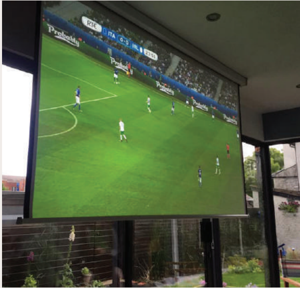
SIZE: 6.4m x 3.6m