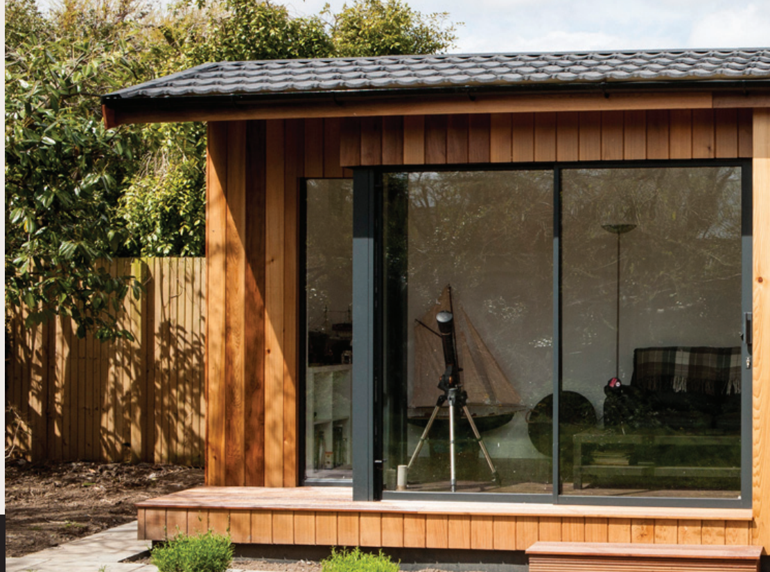
CUBE PITCHED ROOF