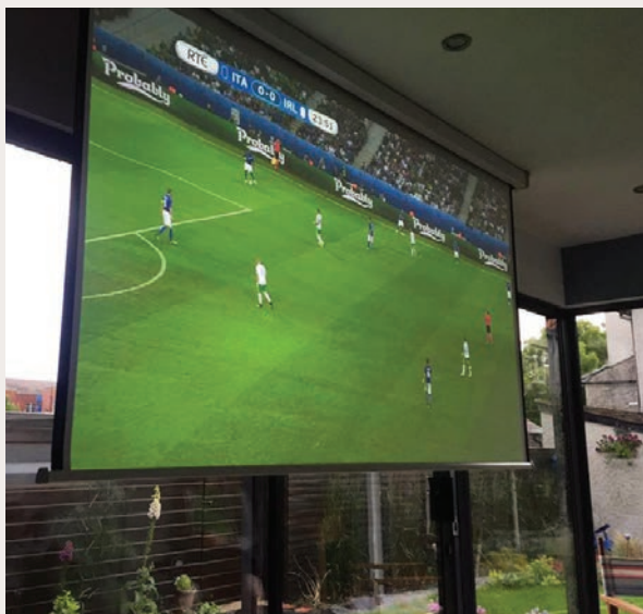
SIZE: 6.4m x 3.6m